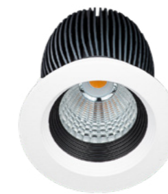
Pro Mini Round

W 106mm x 106mm H 95mm ⌀92 SUITABLE FOR CONCRETE