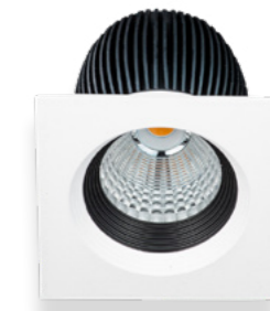
Pro Mini Square