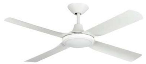
Matt White With matt white blades (Product code: NCL155)