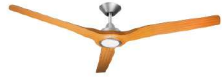
Brushed Aluminium with bamboo finished blades (Product code: DC2443)