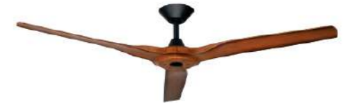
Matt Black With koa finished blades (Product code: DC2426)