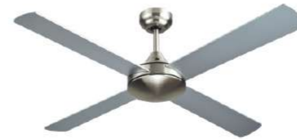
Brushed Nickel with brushed silver timber blades (Product code: A2324)