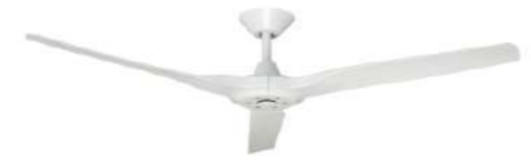
White with white polymer blades (Product code: DC2420)