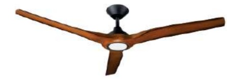
Matt Black With koa finished blades (Product code: DC2446)