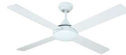
White with white timber blades (Product code: A2323)