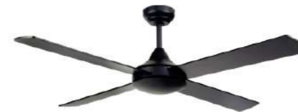
Matt Black with matt black timber blades (Product code: A2322)