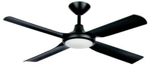
Matt Black With matt black blades (Product code: NCL156)