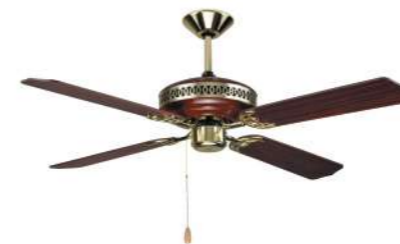
Rosewood with timber blades (Product code:828)