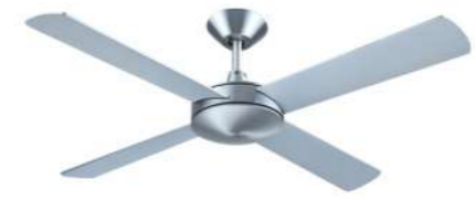
Brushed Aluminium with brushed silver timber blades (Product code: A2301)