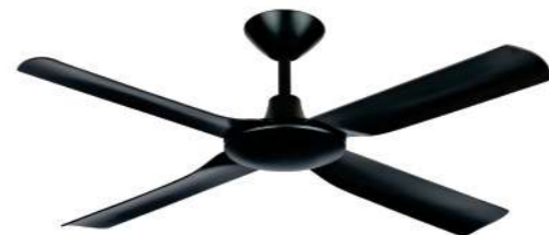
Matt Black with matt black blades (Product code: NC152)