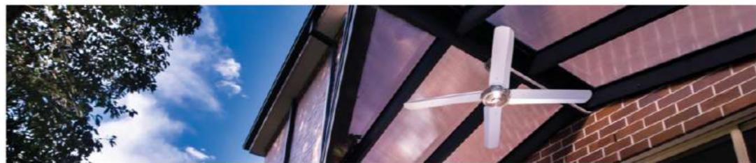
Typhoon 316 Stainless Steel model shown