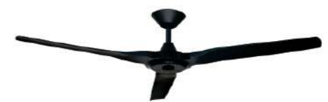
Matt Black with matt black polymer blades (Product code: DC2422)