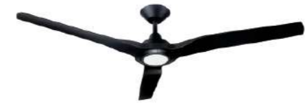
Matt Black With matt black polymer blades (Product code: DC2442)