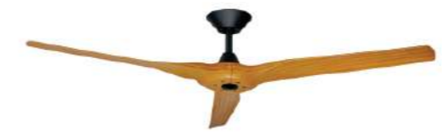
Matt Black with bamboo finished blades (Product code: DC2424)