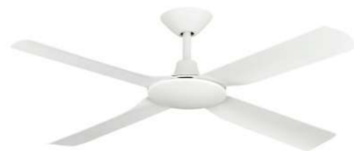
White with matt white blades (Product code: NC151)