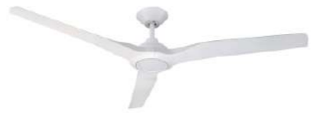
White With white polymer blades (Product code: DC2440)