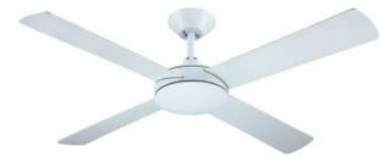
White with white timber blades (Product code: A2300)