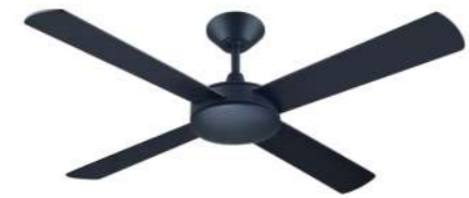
Matt Black with matt black timber blades (Product code: A2302)