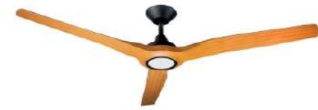
Matt Black With bamboo finished blades (Product code: DC2444)