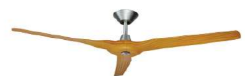
Brushed Aluminium with bamboo finished blades (Product code: DC2423)